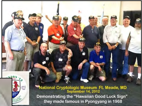
National Cryptologic Museum Ft. Meade, MD September 14, 2012 Demonstrating the "Hawaiian Good Luck Sign" they made famous in Pyongyang in 1968

Anyhow, here's a photo of them demonstrating their famous "Hawaiian 'Good Luck' sign."