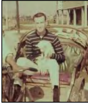
1960 Taipei Pedi Cab.