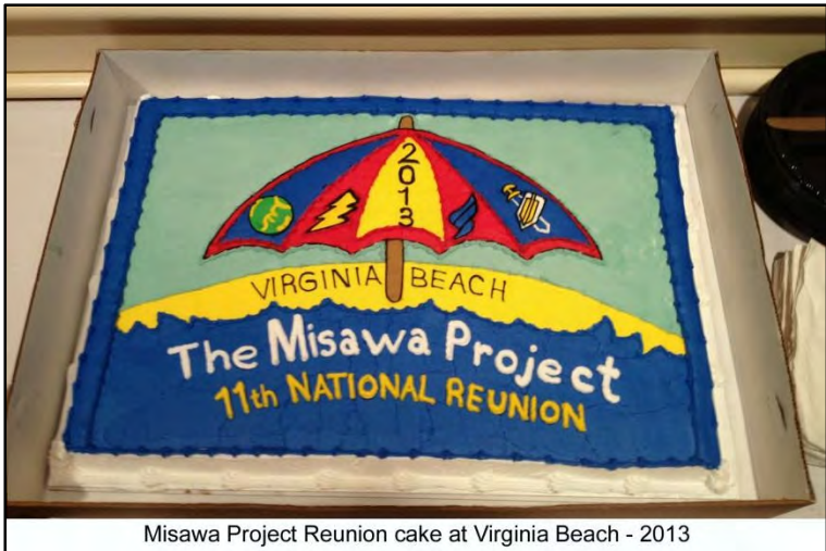
Misawa Project Reunion cake at Virginia Beach - 2013